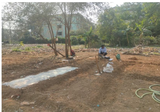
Fig 5: Site selection at GIFT