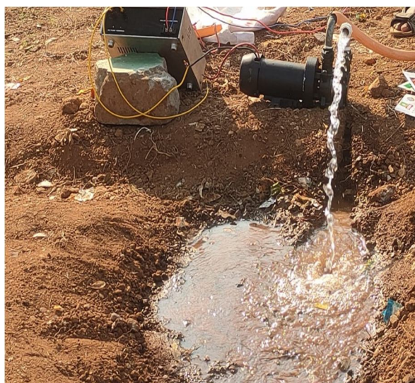
Fig 3: pump and converter in project

Three-stage squirrel-confine enlistment engines are broadly utilized as modern drives since they are self-beginning, dependable, and affordable. Single-stage acceptance engines are utilized broadly for more modest burdens, for example, home devices like fans. Albeit generally utilized in fixed-speed administration, acceptance engines are progressively being utilized with variable-recurrence drives (VFD) in factor speed administration. VFDs offer particularly significant energy investment funds open doors for existing and forthcoming acceptance engines in factor force radial fan, siphon, and blower load applications. Squirrel-confine acceptance engines are broadly utilized in both fixed-speed and variable-recurrence drive applications.