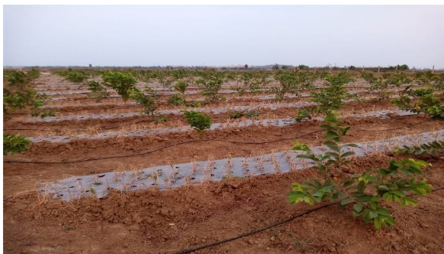
Fig 4: The mulching technique