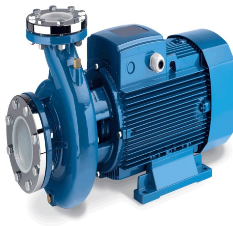
Fig 4: Induction motor