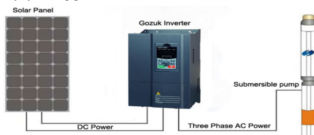
Fig 2: Internal working of a solar based irrigation system

The Sun-based siphoning framework is a series-equal ingest daylight radiation energy through sunlight-based chargers and convert it into AC power by an inverter to drive diffusive siphon, water system siphon, pivotal stream siphon, blended stream siphon of profound well water siphon framework. As per the difference in the force of daylight, sun-oriented siphon inverter framework changes yield recurrence progressively, yielding power near the sun cell cluster most extreme power.