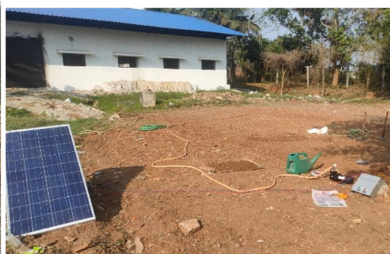
Fig 6: Project setup at GIFT